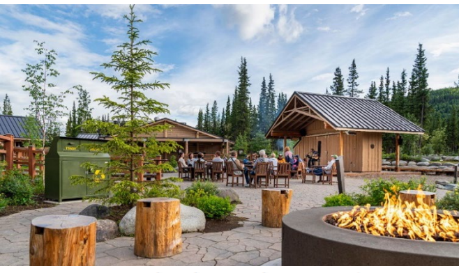
หมายเหตุ ข้อมูลในเอกสารทั้งหมดนี้เป็นข้อมูลเบื้องต้นของสถานที่ทำงาน อาจมีการเปลี่ยนแปดงขึ้นอยู่กับองค์กรแลกเปลี่ยนฯ และ สถานที่ทำงาน ทางบริษัทฯ ขอสงวนสิทธิ์ ในการเปลี่ยนแปดงข้อมูลโดยไม่ต้องแจ้งให้ทราบส่วงหน้า