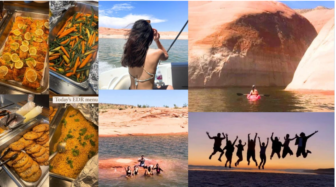
Today's EDR menu

หมายเหตุ ข้อมูลในเอกสารทั้งหมดนี้เป็นข้อมูลเบื้องต้นของสถานที่ทำงาน อาจมีการเปลี่ยนแปลงขึ้นอยู่กับองค์กรแลกเปลี่ยน และ สถานที่ทำงาน ทางบริษัท ขอสงวนสิทธิ์ในการเปลี่ยนแปลงข้อมูล โดยไม่ต้องแจ้งให้ทราบล่วงหน้า